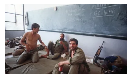
Fears of a Gaza Quagmire: Is Israel in Another Long War of Attrition?