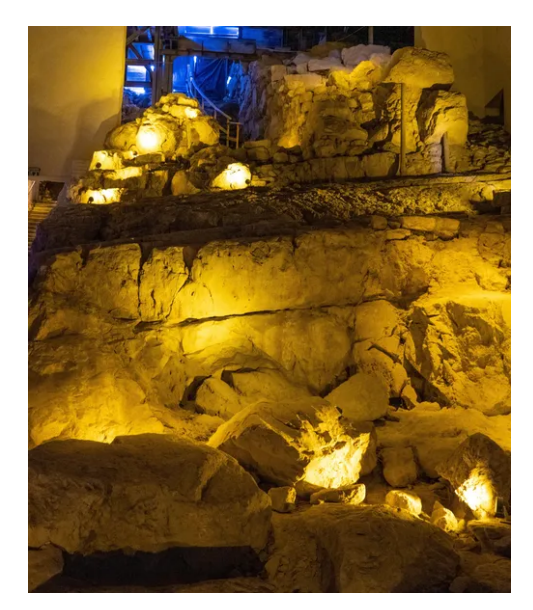
Lost Biblical Monument in Jerusalem Is in Plain Sight, New Theory Claims