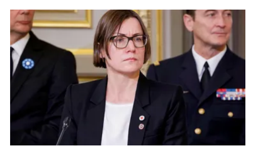
Hadassah Women Group Slams Red Cross' Failure to Treat Israeli Hostages Held in Gaza