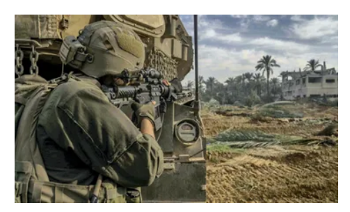
Report: Israel Asks Egypt to Mediate New Hostage Deal; U.K. Bans Entry of Violent Settlers