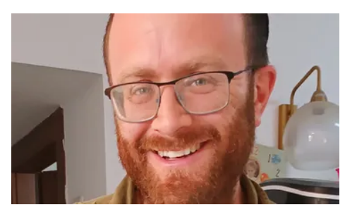
Israeli Army Names Soldier Killed in Gaza Fighting on Wednesday