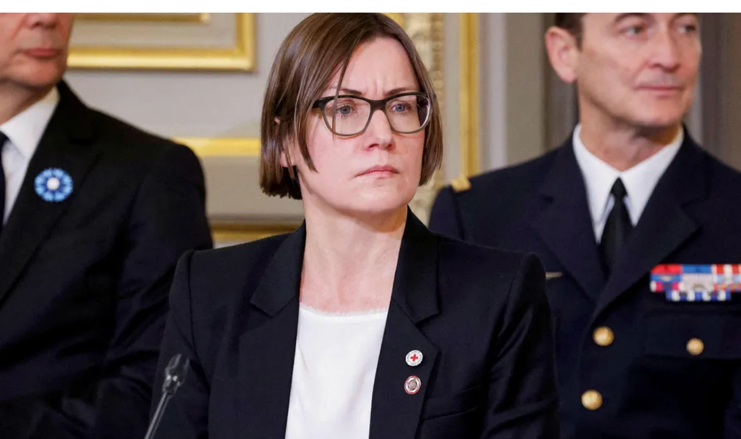
President of the International Committee of the Red Cross (CICR) Mirjana Spoljaric Egger during an international humanitary conference for civilians in Gaza, at the Elysee Presidential Palace, in Paris, on in November.