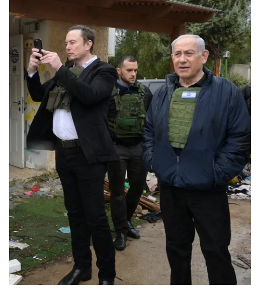
Israel's Repulsive Embrace of Elon Musk Is a Cynical Betrayal of Jews, Dead and Alive