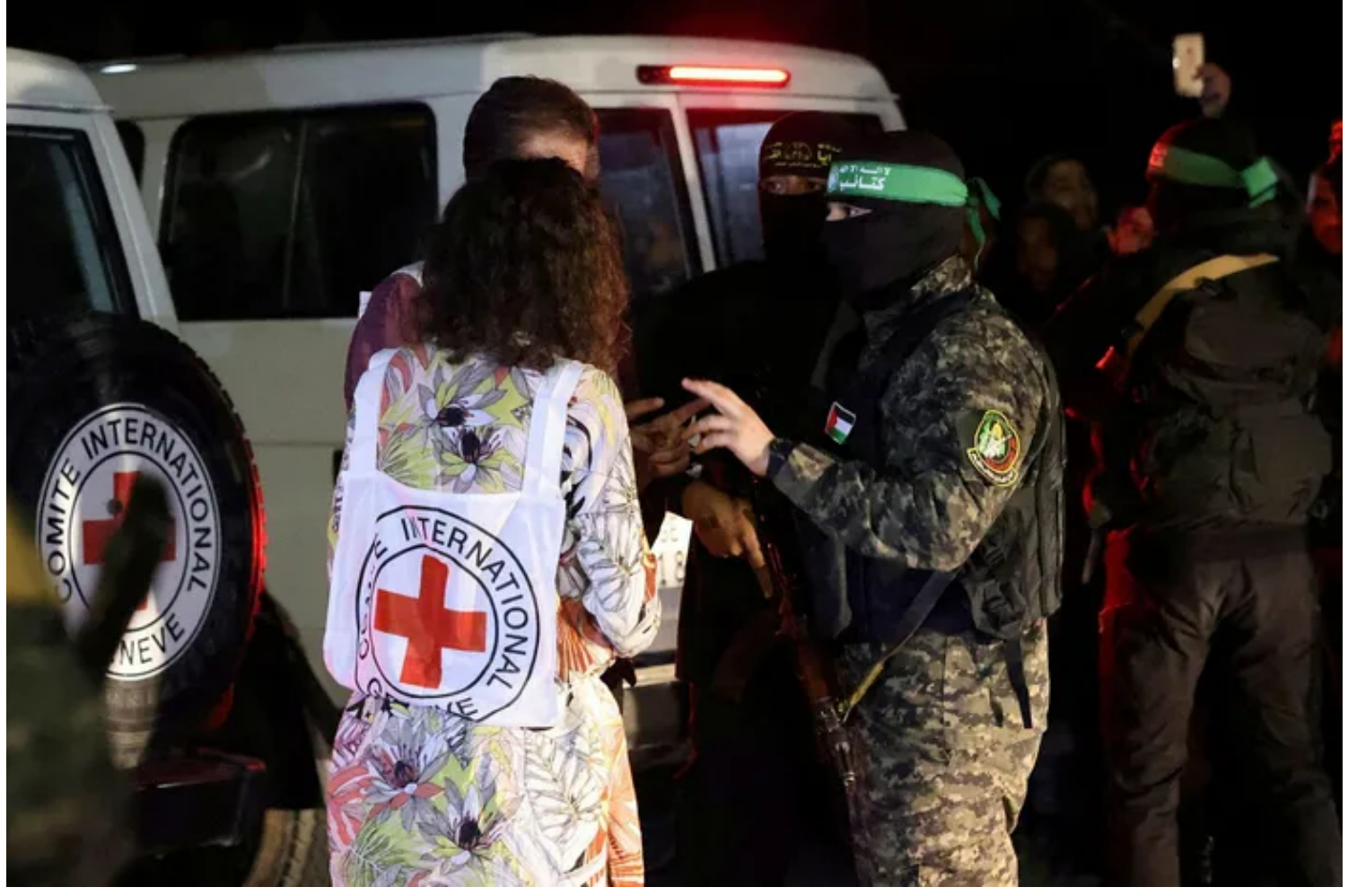
Hamas and Islamic Jihad fighters speak with members of the Red Cross during the release of hostages in Rafah, in the southern Gaza Strip in November.

"With these aims clearly stated on your website, your decision to ignore the hostages abducted from Israel into Gaza calls into serious question the integrity of your 160-year-old organization as you purportedly work to fulfill its mission," the letter says.