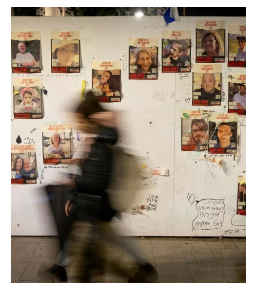
Many Israelis and Palestinians Have 'Sobered Up'. I Refuse to Do the Same