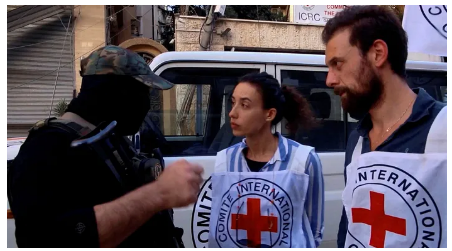
Members of the International Committee of the Red Cross interact with Hamas militants in an unknown location in the Gaza Strip, in this screengrab taken from video released in the end of November.

The letter continues, "we turn to you with a sharp and clear call to immediately visit all hostages abducted from Israel and held in Gaza. There is no justification for leaving them to languish without the care and intervention afforded to all detainees around the world by the Red Cross."